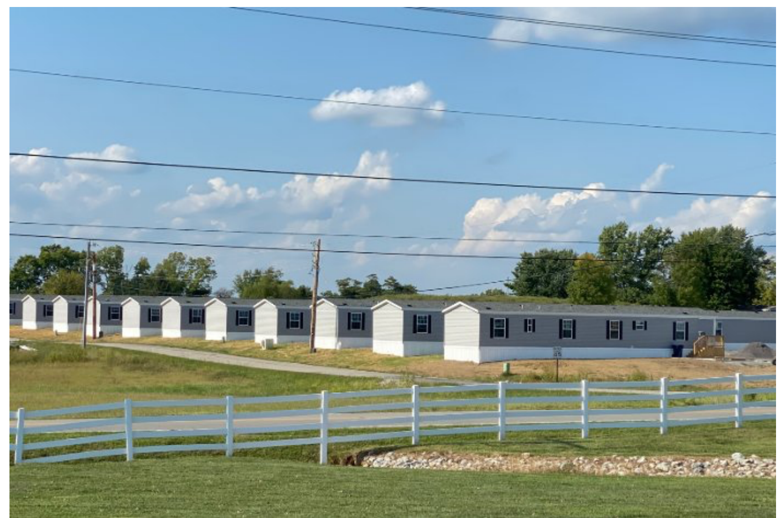
The World Equestrian Center - Ohio team has added 53 "Home Away From Homes" to the Wilmington, Ohio, facility in preparation for the 2020 Capital Challenge Horse Show.

In preparation for hosting the year-end finale horse show, the World Equestrian Center team has accelerated their work plan, adding 53 "<u>Home Away From Home</u>" units to the facility, as well as installing Dutch doors in each stall of two of the main barns, expanding the horse trailer parking area, adding additional RV camp sites, and more.