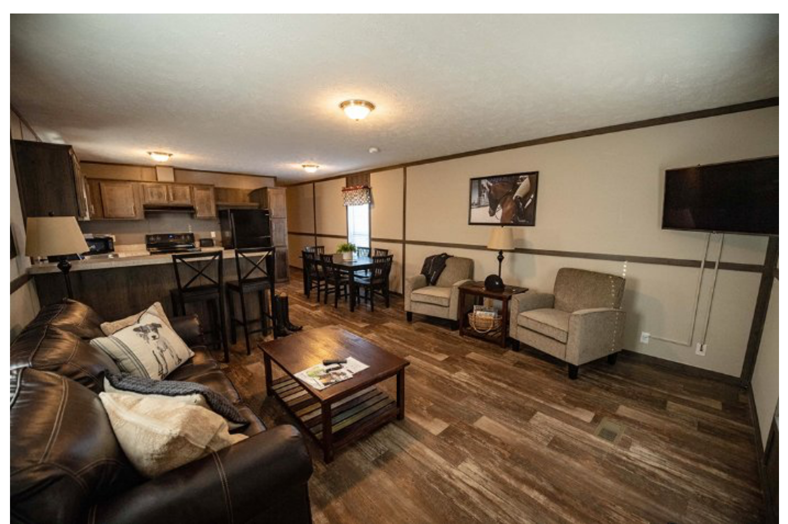
The interior of one of the "Home Away From Homes" that has been fully furnished and decorated.

The Capital Challenge Horse Show will also mark the debut of the World Equestrian Center's Wilbur Estate, which will offer five luxury suite rentals. The addition of the new lodging options was slated to be completed in the coming months, but the World Equestrian Center's staff jumped into action to move the projects forward in advance of Capital Challenge. With the addition of the 53 new units, the facility now offers 125 total two- and three-bedroom "Home Away From Homes."