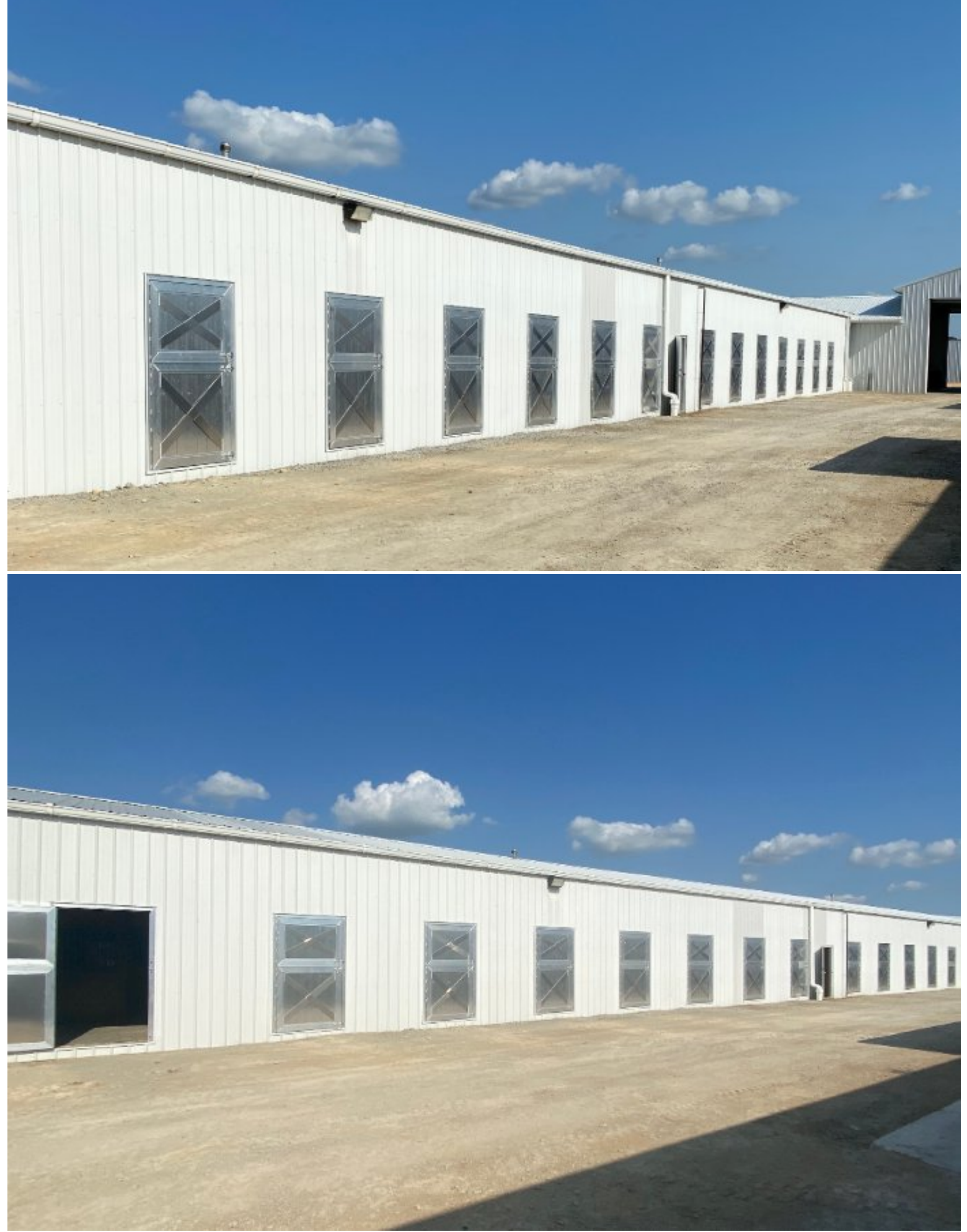
Dutch doors installed in two of the barns.

"It's going to allow a lot more air flow in those barns," explained TJ Campbell, general manager of the World Equestrian Center – Ohio. "With the Dutch doors, the horses will be able to stick their heads out the window, and for people who may not want to walk down the aisle way, they can walk a horse in and out from the outside of a good number of the stalls without having to actually go in the barn."