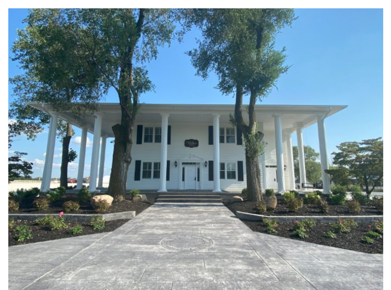
The new Wilbur Estate will offer five luxury suite rentals with full kitchens plus washers and dryers.

The Capital Challenge Horse Show will also mark the debut of the World Equestrian Center's Wilbur Estate, which will offer five luxury suite rentals. The addition of the new lodging options was slated to be completed in the coming months, but the World Equestrian Center's staff jumped into action to move the projects forward in advance of Capital Challenge. With the addition of the 53 new units, the facility now offers 125 total two- and three-bedroom "Home Away From Homes."